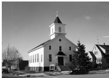
The Building on 17th Street