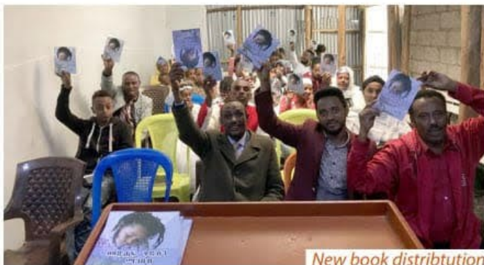
New book distribution

glad to be able to put God's Word in the hands of the spiritually hungry. They also organize biblical training programs and distribute Christian literature to newly-planted churches in those areas.