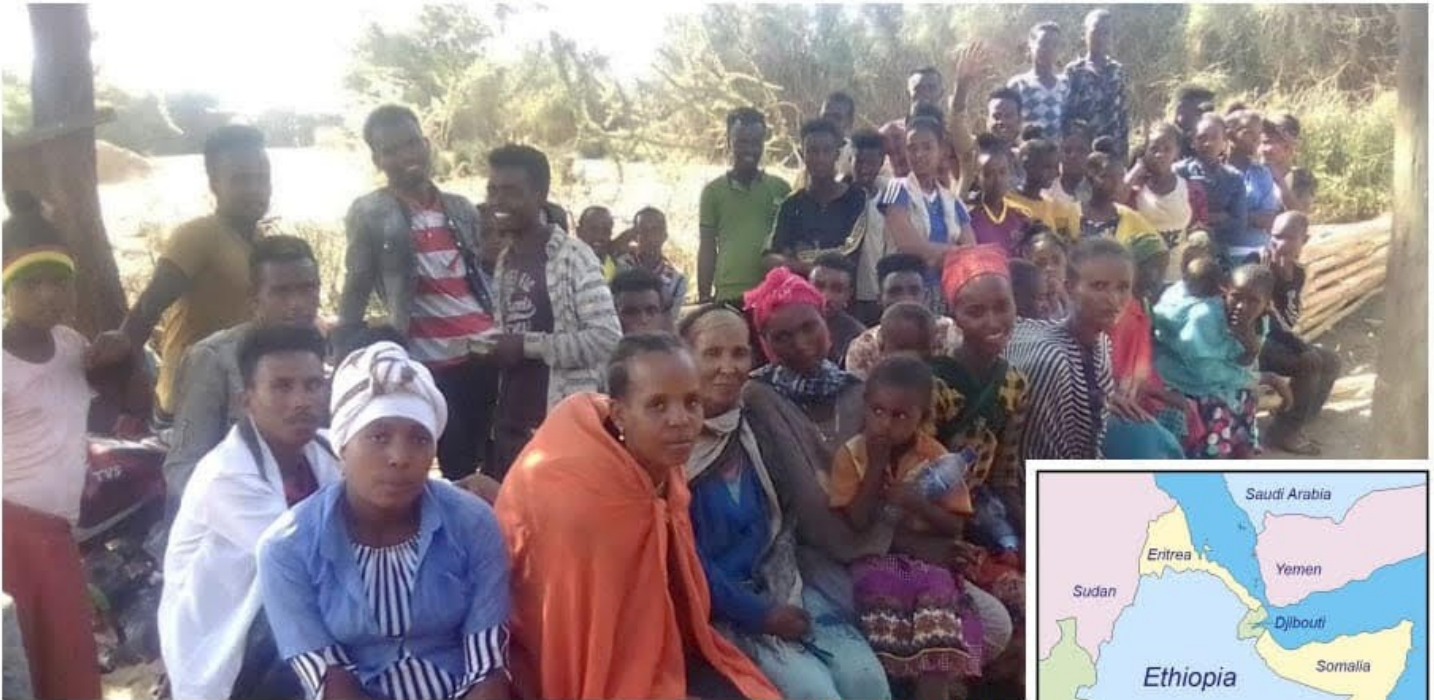
Wonji Church members