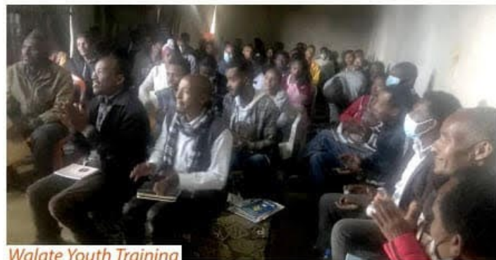
Walate Youth Training

to help an Eritrean refugee congregation. Fleeing armed conflict in the north, they were enabled to get reestablished in the capital, where they have opportu-