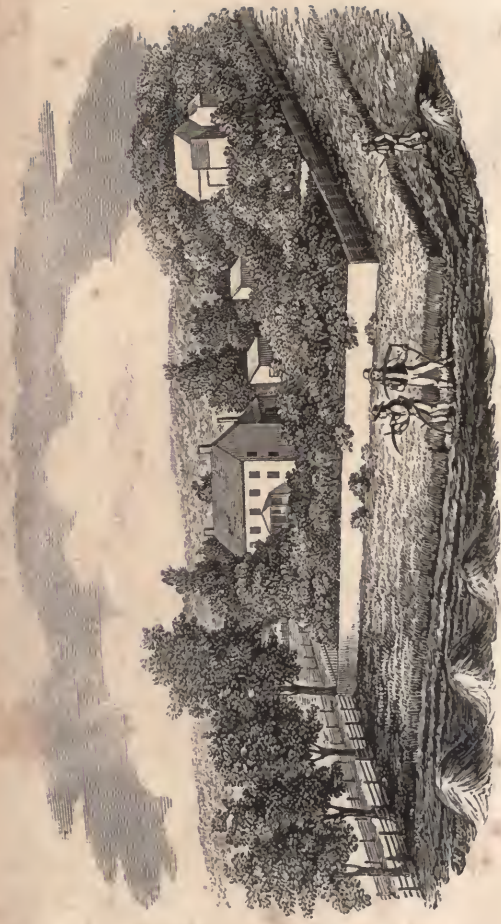
View of the Parsonage in Cranbury, New-Jersey, July, 1833. Occupying the ground where Brainerd preached to the Indians, 1716.