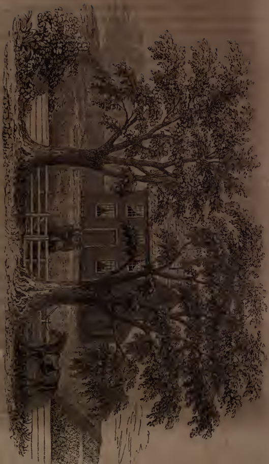
President Edwards' House, Northampton, Massachusetts.