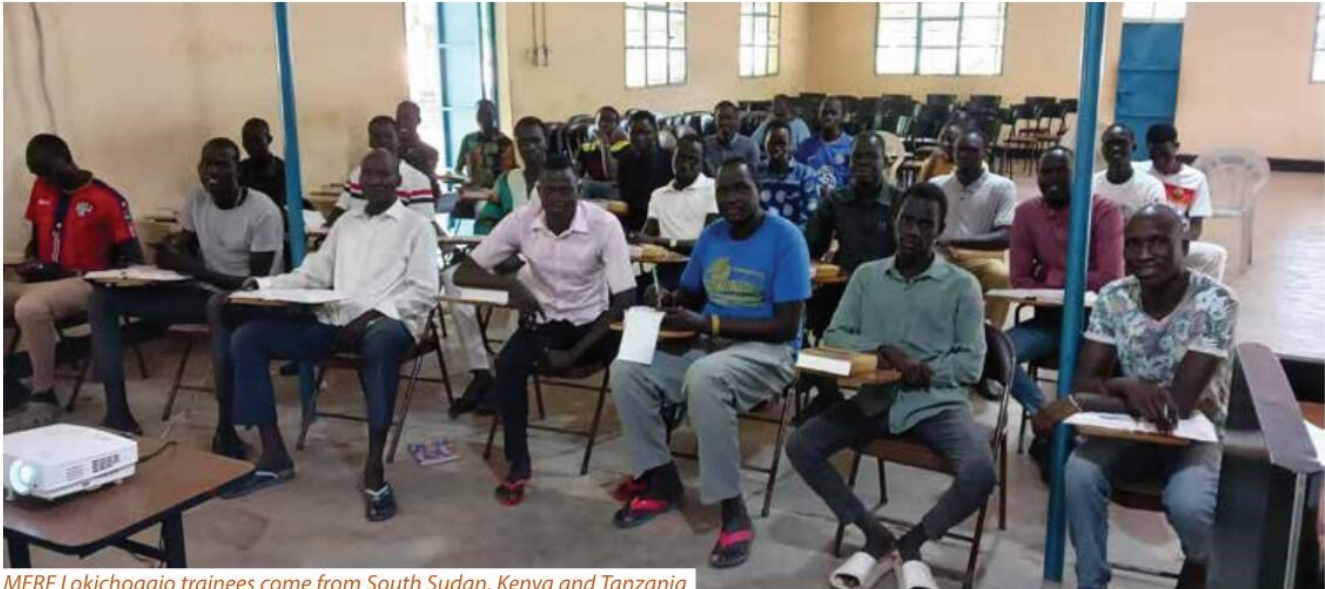
MERF Lokichoggio trainees come from South Sudan, Kenya and Tanzania

The Augustine Program provides intensive biblical training for God's servants in MERF fields. It was developed for those in church leadership lacking opportunity for Bible and Christian doctrine education, especially in war-torn South Sudan. Over the years, the program has extended to train church leaders in Kenya, Ethiopia and Tanzania and beyond.