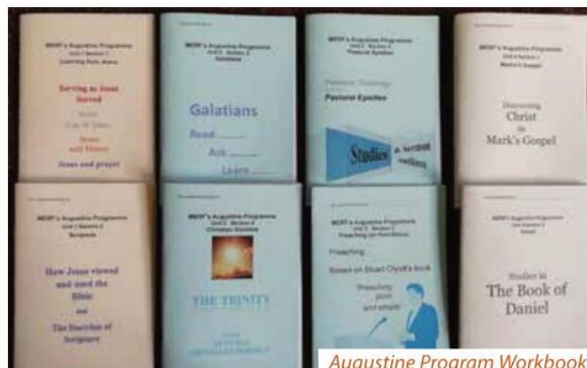
Augustine Program Workbooks

"What you have heard from me in the presence of many witnesses entrust to faithful men, who will be able to teach others also." — 2 Timothy 2:2