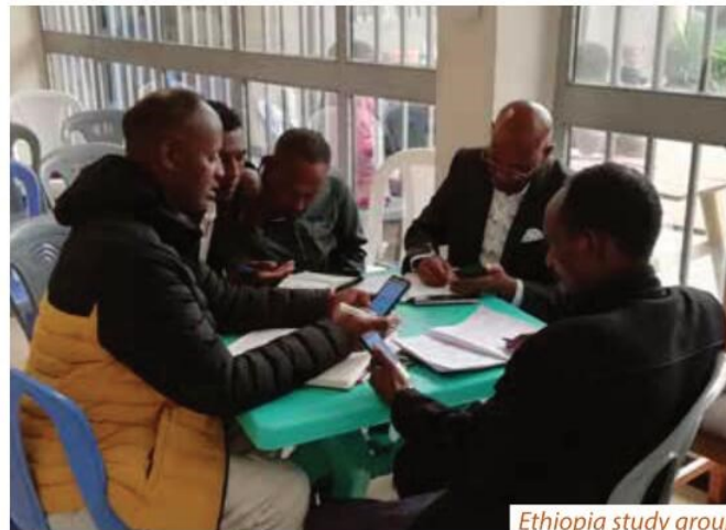
Ethiopia study group

Also, as MERF Augustine Program coordinator, I will be addressing church leaders on the Five Solas of the Reformation at a July Reformed Church of Tanzania conference. These studies will then be