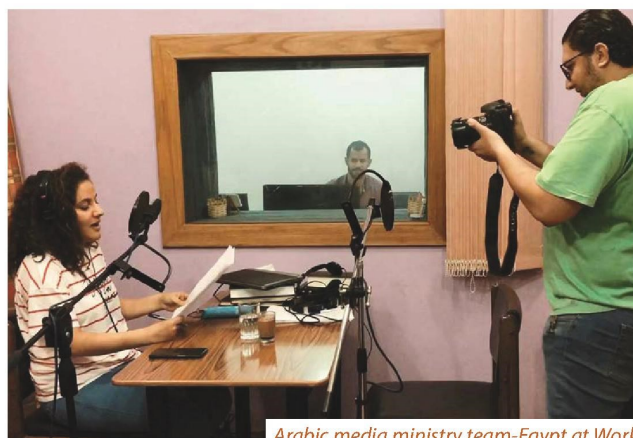
Arabic media ministry team-Egypt at Work

Arabic Media Team - Khartoum, SUDAN (north) - We are excited that now we have more freedom than before to share the gospel over radio and TV under the new authori-