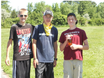
Recreation Team! What a great team of young men working with all the kids!