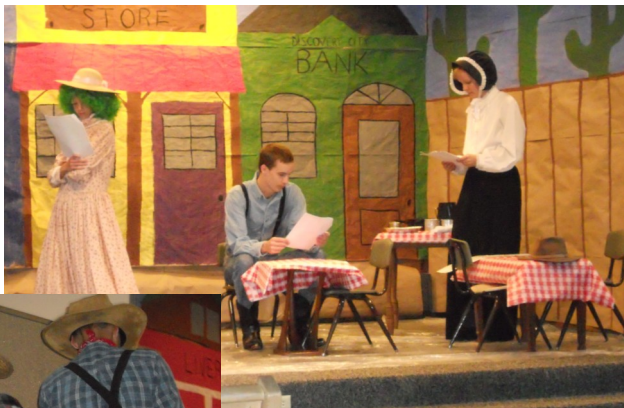
Caleb the Prospector is about to be mistaken for his twin brother, Dr. Marvel by Petunia Periwinkle