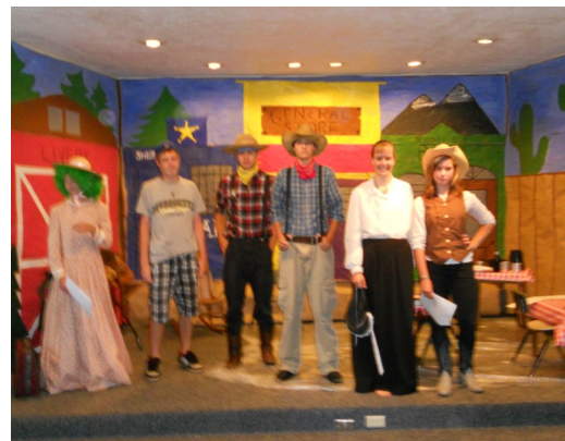
(L-R) Petunia Periwinkle, Bubba Grizzly, Otis Henry, Theodore Tweedle, Sadie Brown, Kate the Snake