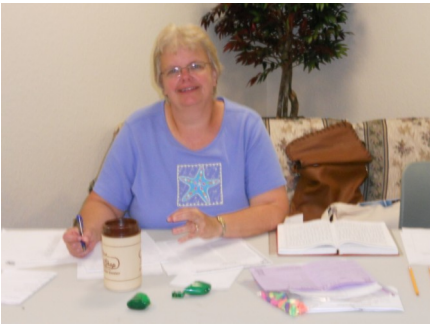
A friendly smile to greet the students at the VBS registration table! Here's where you get your VBS badge!