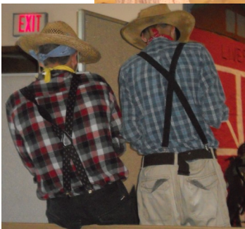
Cringing in terror from Kate the Snake!