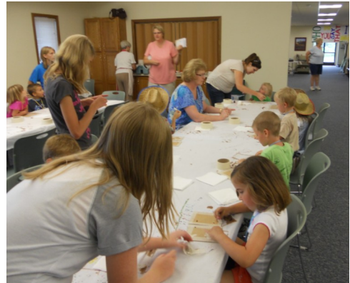
Craft class in session! How 'bout all those helpers! What a blessing they were!