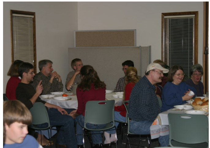
Enjoying the food & fellowship at the Harvest Home Dinner.