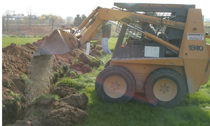
The trustees working hard on the church grounds.