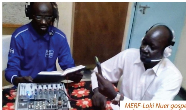
MERF-Loki Nuer gospel broadcast recording

MERF Farsi online gospel media ministries reached more Iranians, Afghans and others with the help of added staff. Of the 22 MERF Arabic