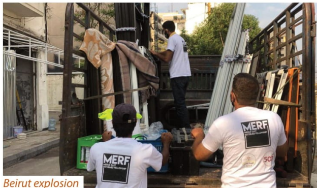
Beirut explosion needy home repair project

Syrian families joined his church, one from an extremist background. Many churches in Lebanon are experiencing similar blessings. Also, many in Kurdish communities are coming to the Lord. A new local Kurdish-speaking congregation is organized. It enjoys close fellowship with other churches. May the Lord to continue to open new doors of gospel opportunity.