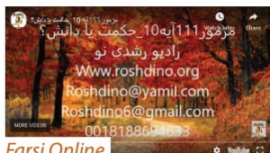
Farsi Online Direct Gospel Radio

A special report on MERF diaconal aid to traumatized victims of the Beirut port explosion told of new openness to the gospel in previously indifferent and closed neighborhoods. The Lord enabled staff to organize teams of handymen and volunteers. They have repaired more than 600 homes and helped more than 2000 families with food and medication. All practical help was accompanied by spiritual care, listening, praying and distributing gospel literature. In 2021 personal follow-up is planned to the thousands of individuals and families served.